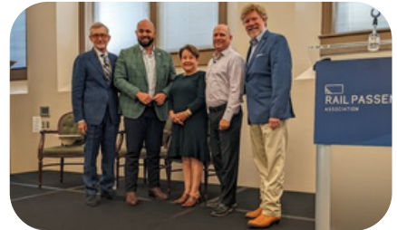
Mayors of Mississippi and our CEO celebrating passenger rail expansion

Rail corridors generate value by acting as economic engines in the communities they serve - through jobs, retail, mobility, tourism, and real-estate development. The Association conducts research into the economic, social, civic, and public policy impacts of passenger and commuter rail for communities of all sizes.