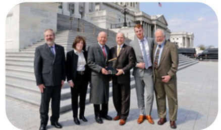
Presenting the Golden Spike Award to Representative DeFazio in Washington, D.C.